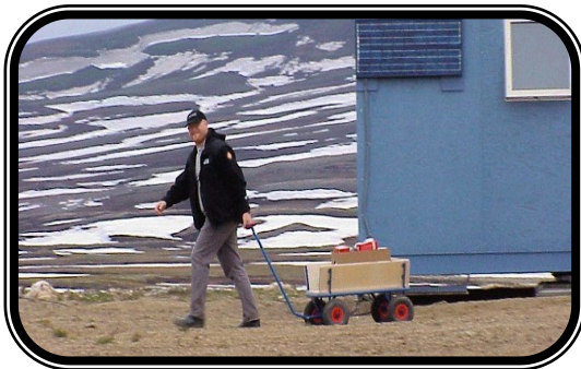
Population in the National park

Recently only 31 people and about 110 dogs were present over winter in North East Greenland, distributed among the following stations (all on the coast, except Summit Camp).