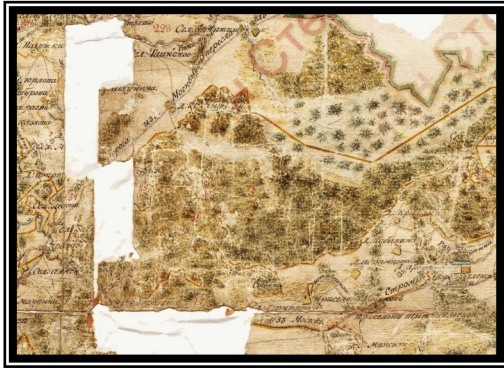
Old map of the park.