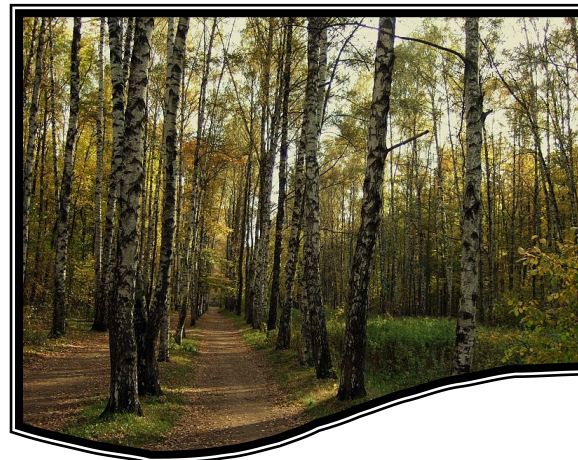
This is alley in the park.

In the park are organized rides and horse rides.